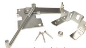
Cam Lock Jamb Latch